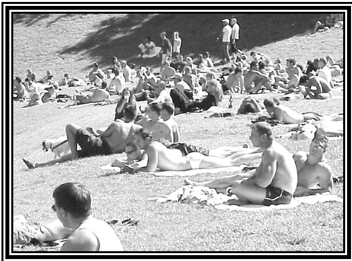
The summer sun attracted hundreds to "Dolores Beach" (aka Dolores Park) this Labor Day Weekend. People worked on tans, kids and parents grilled out, and dogs played ball.