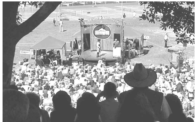
Hundreds gathered on the lower terrace of Dolores Park to enjoy the afternoon San Francisco Mime Troupe shows on Labor Day Weekend.

Want to avoid waiting around? Try http://www.nextbus.com/ for satellite-tracked arrival times for the Shuttle, K, L, M, N & J metro trains.